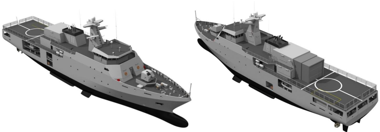
Vessel shown with hangar in extended position.